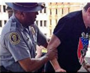
Photo of Black Official Helping Man