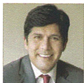
Kevin de León